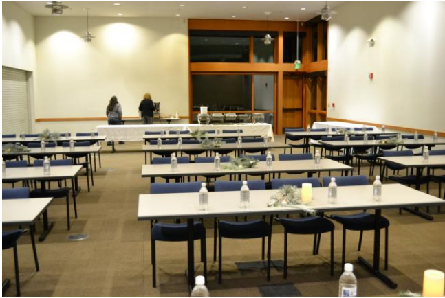
Set-up is nearly complete. Decorations provided by Irene Murakami (Rainier View). Bottled water courtesy of Mountain Mist.