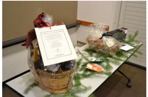
Door prizes provided by contributing partners and the Co-op.