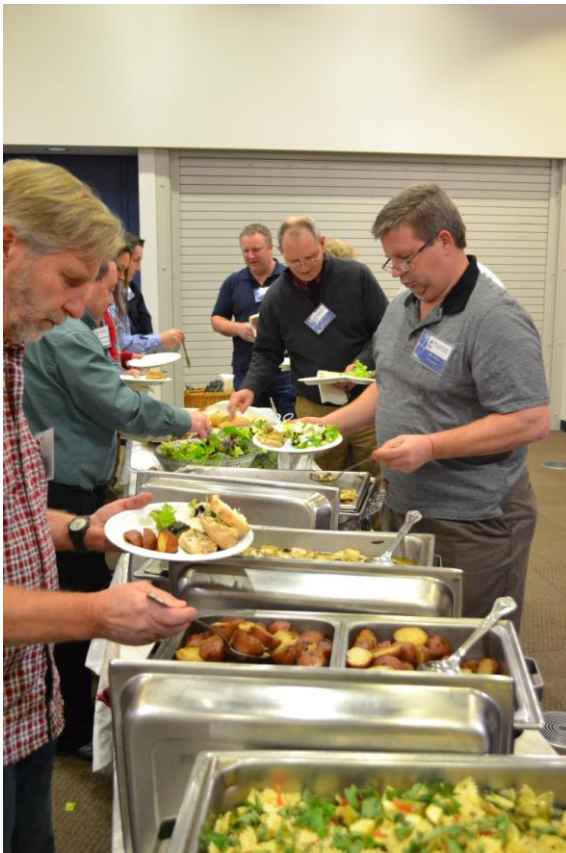
We had a good spread from Dean Allen Catering.