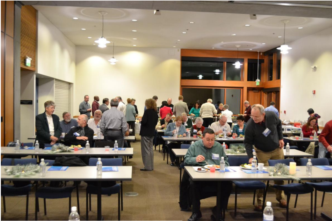
Dinner was a success!