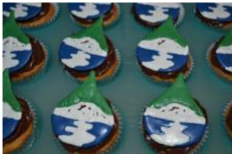
Cupcakes with the Co-op logo!