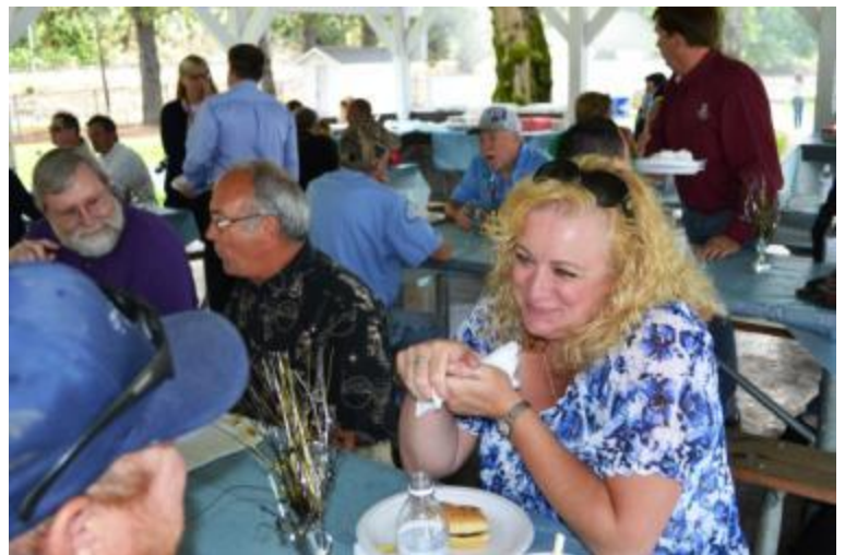
Lunch was great!